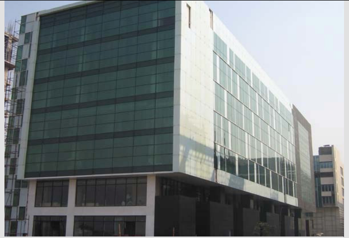
Plaza M6, Plot No.6