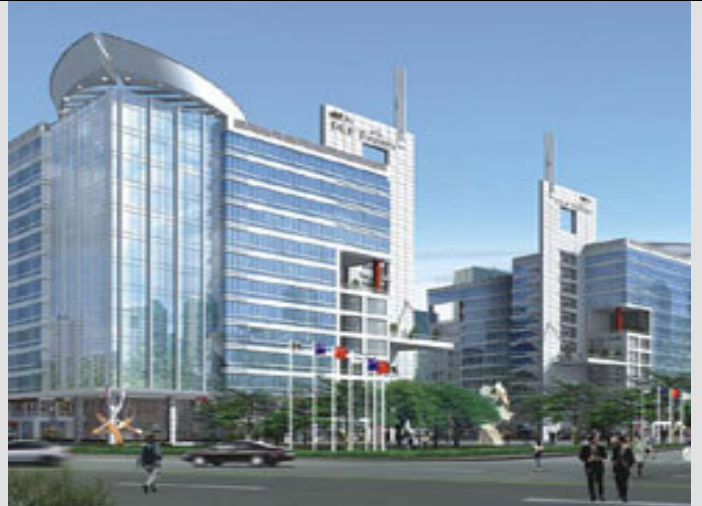
DLF Towers, Plot No.10, 11