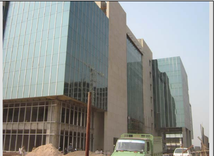
COPIA Corporate Suites, Plot No.9