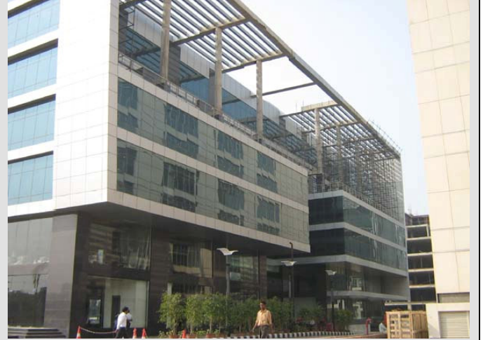
Elegance Tower, Plot No.8